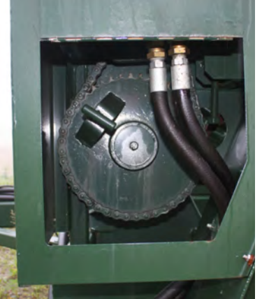
FIG. 2 FIG. 3